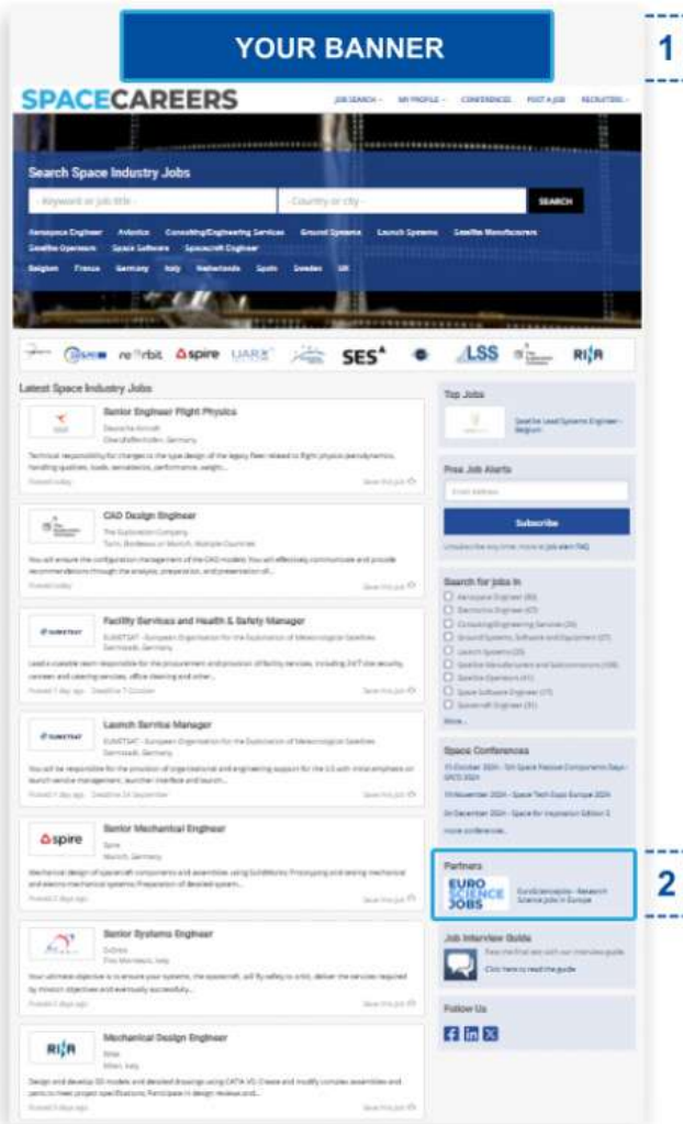
1. Leader board Banner / 2. Partner Profile

Please don't hesitate to contact us to find out more!